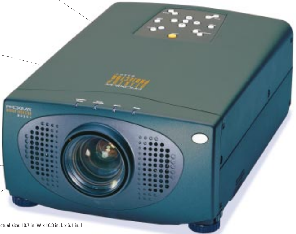
actual size: 10.7 in. W x 16.3 in. L x 6.1 in. H

A WINNING IMAGE "auto image" feature automatically calibrates the picture